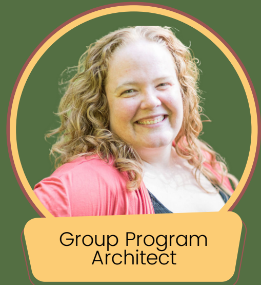
Group Program Architect

https://app.helloaudio.fm/feed/441d3a0f-2a17-4328-8039-009fab06fd30/signup